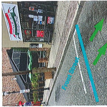
Start Photo view is facing E on Front St, even with electric meters in front of entrance doors to #12