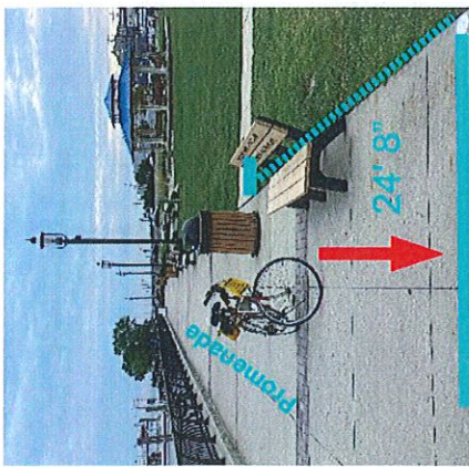
Finish Photo view is facing NE, 24' 8" SW of W edge of the sidewalk west of the gazebo