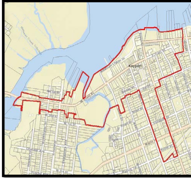
Approved Revision of Keyport Parcel Map as of Year 3